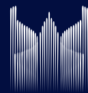
THE DUBAI FOUNTAIN

The spectacular neighbourhood of Arts and Culture